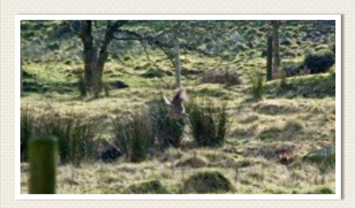
Top picture -walking to do the evening flight on the Isle-of-Bute, Bob Glynn and Dave Ferguson with the best bag to two guns in 2010 - I day!!! a woodcock makes a break for freedom