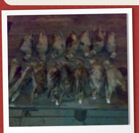
GOOD DAY 1 GUN 1 POINTER

We are advertising direct into Italy in 2012 have appointed agents for France and Holland remember we only have from last week October to end of January book early not to be disappointed.